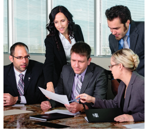
Toxicology Consulting Team

Our goal at Nelson Laboratories is to help you achieve success. Before your next cytotoxicity test, contact your Nelson Labs sales rep or call 800-826-2088 , to determine if this program can help move your project forward.